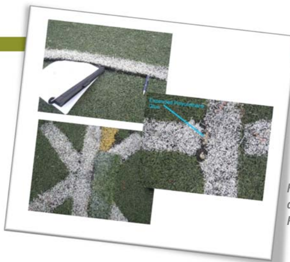
Failed, Patched and Poorly Repaired Turf Field