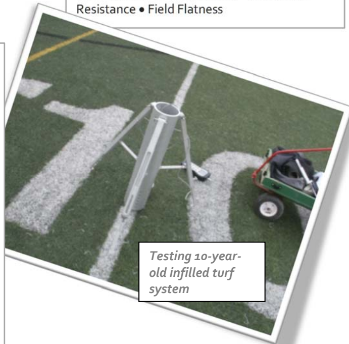
Testing 10-year-old infilled turf system

ASTM has been unable to develop a new HIC test method or specification. The efforts to develop even a basic test method have been blocked by a group of manufacturers and installers. There is data to suggest that HIC values should be below 700 if the field is to provide significant protection against concussions. There is no data to suggest what an appropriate impact velocity is, and that would be needed to establish a minimum allowable fall height. While this is true, some turf systems exceed 700 HIC at a 1 ft fall height, while others support fall heights of up to 5 ft. Owners and architects will have to decide what is right for each project. A minimum fall height value of 3 ft would provide assurance that the field would provide some concussion protection for at least some head-turf impacts.