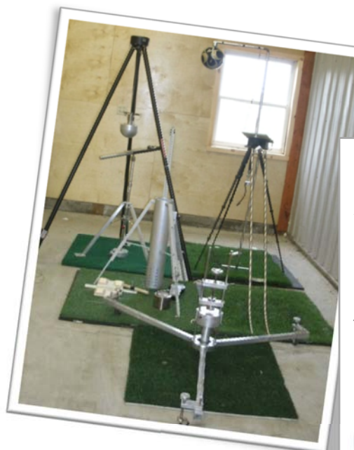
Suite of Turf Test Equipment (ASTM and FIFA)

This page has been developed to introduce some of the new performance and safety parameters that may be encountered in your next synthetic turf field selection.